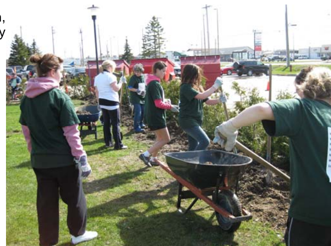
SWB members add the final soil