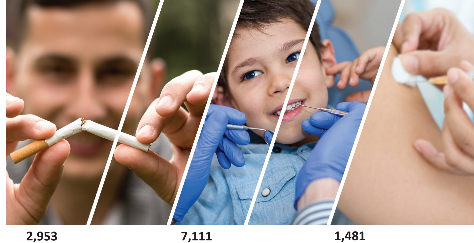
clients received an intital quit smoking assessment

Whether it is encouraging you to quit smoking, screening your child for dental decay or being up-to-date with your immunizations, public health works to make the healthy choice, the easy choice.