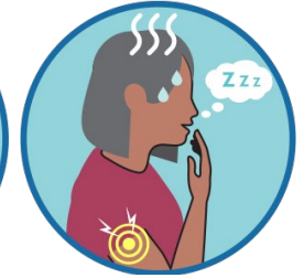
Very tired, sore muscles or joints* (age <18 only)

If you have an existing health condition that gives you the symptoms, select “No,” unless the symptom is new, different or getting worse.