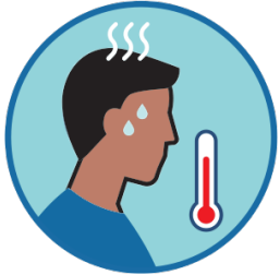
Fever or chills